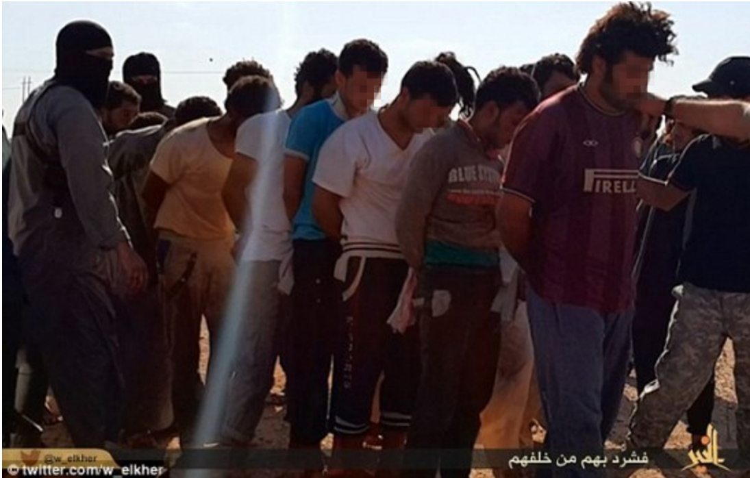
Screen capture of ISIS video, originally from Twitter, August 2014.

The fate of those detained remains unknown, though most reports indicate that they were executed.